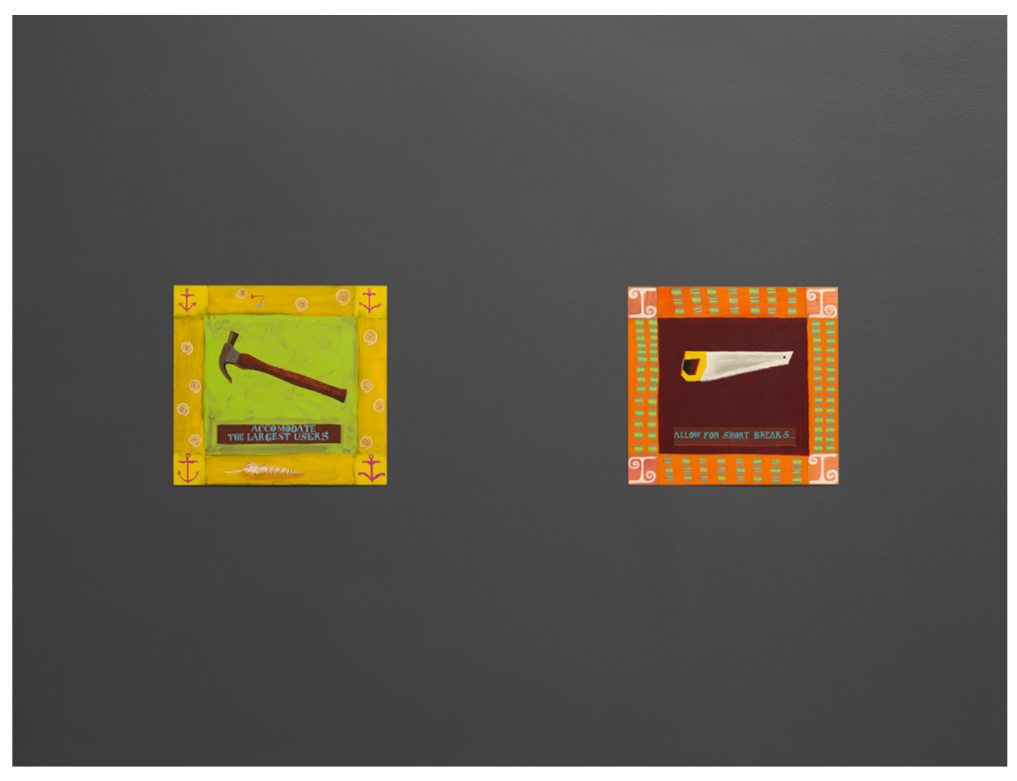
Lubaina Himid: Work from Underneath, 2019. Exhibition view: New Museum, New York.

The <u>New Museum</u>'s multiple summer <u>exhibitions</u> has work that could intrigue architects.