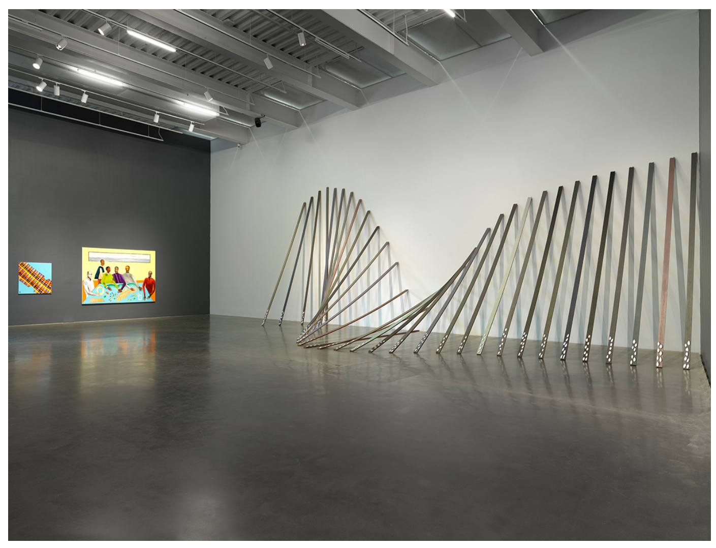
Lubaina Himid: Work from Underneath, 2019. Exhibition view: New Museum, New York.

Meanwhile, Old Boat / New Money (2019) is an installation of 32 leaning planks that invoke a ghost ship stuck in the building to suggest that history is embedded in contemporary spaces.